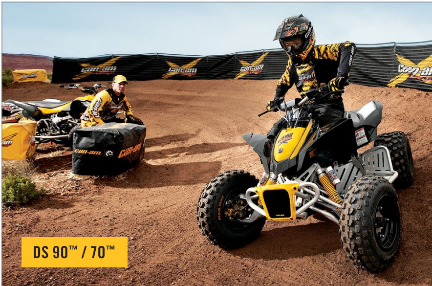
DS 90 X shown.