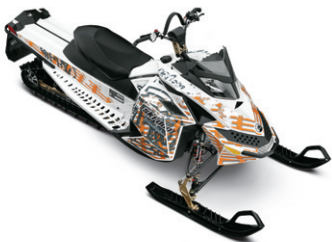
Out of Bounds